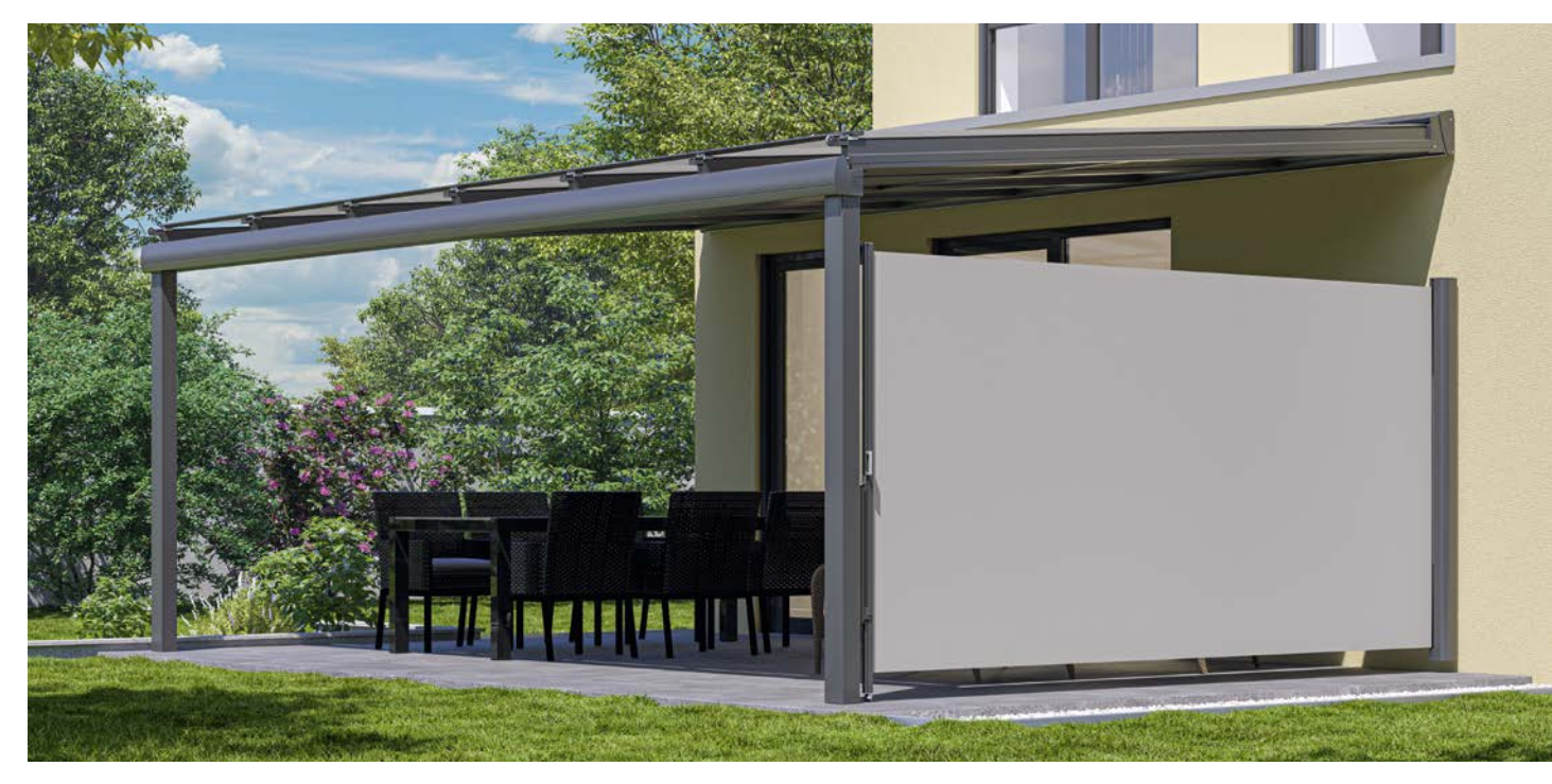
Private refuge – well protected from prying eyes and annoying draughts.

The Micro 700 forms the perfect complement to a glass roof or awning (shown here with Murano Integrale glass roof from Lewens).